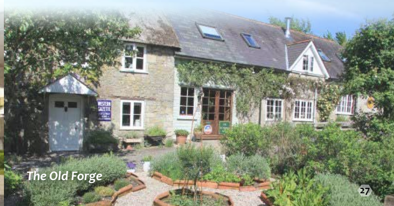
The Old Forge