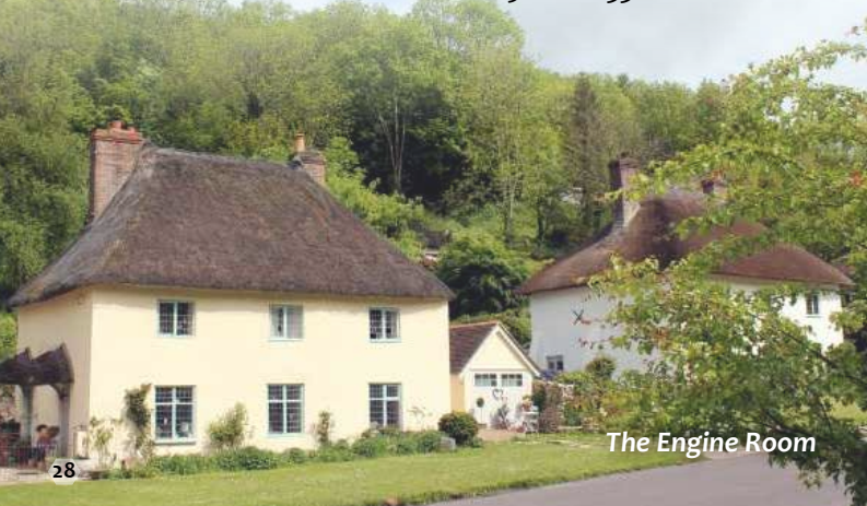
The Engine Room