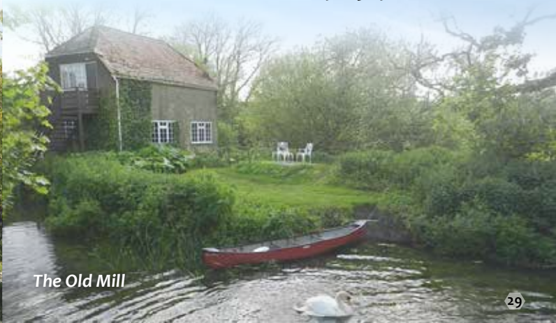
The Old Mill