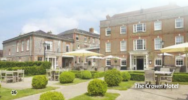
The Crown Hotel